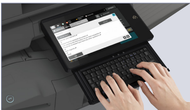
Built-in retractable keyboard simplifies email address and subject line entries.