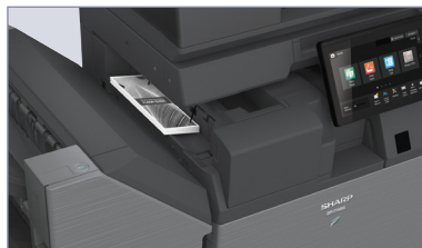
New Inner Folding Unit option offers a variety of fold patterns, including c-fold, z-fold and others.