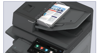
High capacity 300-sheet DSPF scans documents at up to 300 images per minute.