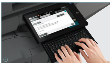
Built-in retractable keyboard simplifies email address and subject line entries.