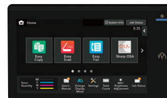
10.1" (diagonally measured) customizable touchscreen display.