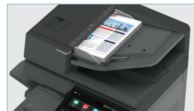
High capacity 300-sheet DSPF scans documents at up to 300 images per minute.