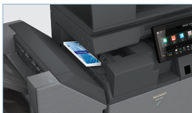
Inner Folding Unit option offers a variety of fold patterns, including c-fold, z-fold and others.