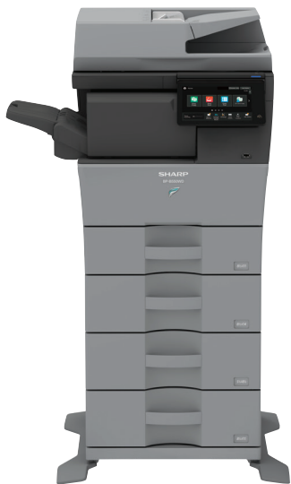
BP-B550WD shown with Inner Finishing Unit in a 4-drawer configuration.