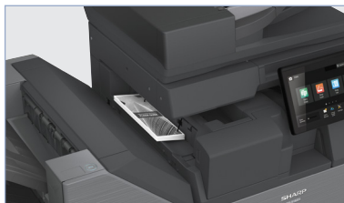
Inner Folding Unit option offers a variety of fold patterns, including c-fold, z-fold and others.