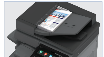
100-sheet RSPF scans documents at up to 80 images per minute.