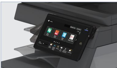
Pivoting touchscreen adjusts instantly for the perfect viewing angle.